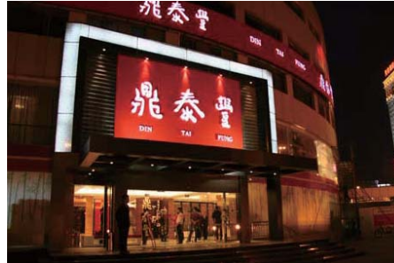
Din Tai Fung Restaurant