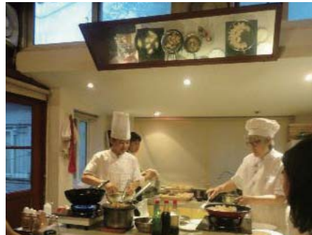
Black Sesame Kitchen