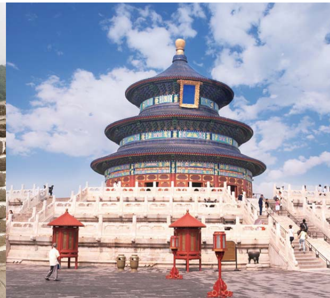
The Temple of Heaven